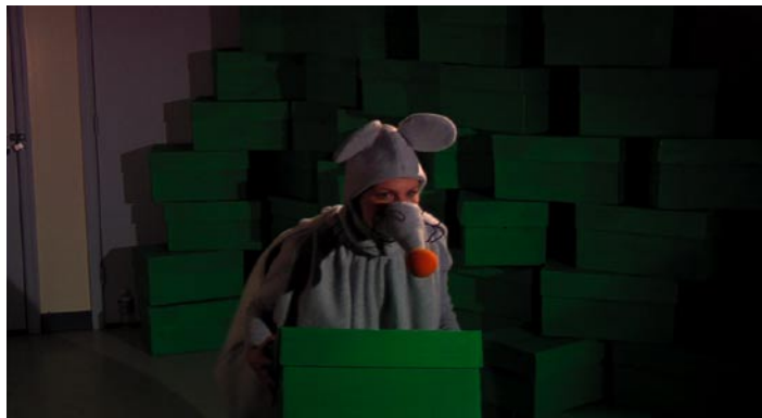
Buff Sigrist as Blue throws props.

The Green Machine marks Buff Sigrist's first foray into film, a trial by fire. On location, Buff would be the only person to serve dual roles as both a member of crew and cast. Currently Buff is pursuing a postgraduate degree in biology.